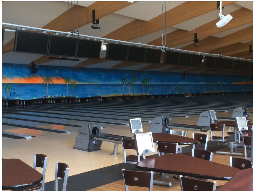
Dream-Bowl Palace - Lanes